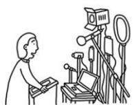
CHURCH MINISTERS, WHO HAVE KEPT EVERYTHING GOING