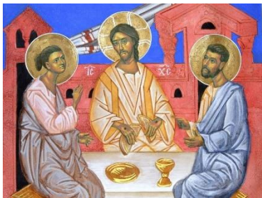
The Supper at Emmaus