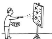
ALL KINDS OF CREATIVE ENDEAVOURS