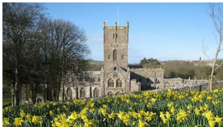
St David's Cathedral