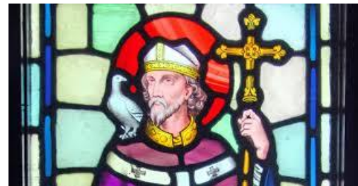
St David, Patron Saint of Wales