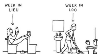
WHERE WE'RE UP TO ON THE ROTAS

Attached to this Bulletin are these items ~