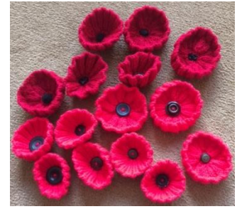
Poppies made by Church members