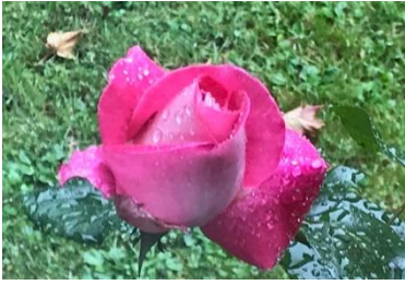
The last rose of summer?